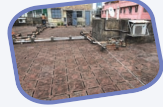
Before and after looks of the rehabilitated Tai Fong Buildings in Tai Kok Tsui.