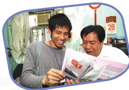
A social service team member introduces its service to a resident in San Shan Road Project.

URA has also contracted four non-governmental organisations to provide four Social Service Teams, whose role is to assist people affected by URA's projects before, during and after acquisition of relevant sites in Central and Western, Wan Chai, Kowloon and Kwun Tong respectively.