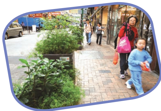
New paving and street planting in Tai Tsun Street, Tai Kok Tsui.

The extensive improvement studies in Tai Kok Tsui and Sham Shui Po, which are geared at linking together new redevelopment projects in these districts, have now reached their detailed design stages. Works on Phase I of the revitalisation of Beech Street in Tai Kok Tsui commenced in March 2009, while the design for the roundabout linking Florient Rise in Cherry Street and the Beech Street revitalisation area is now under preparation with the aim of commencing works in 2009/2010. Apart from providing new paving and street furniture, these studies grasp the opportunities for pavement widening and pedestrianisation to allow street planting, create open space and promote vitality in these highly congested urban areas.