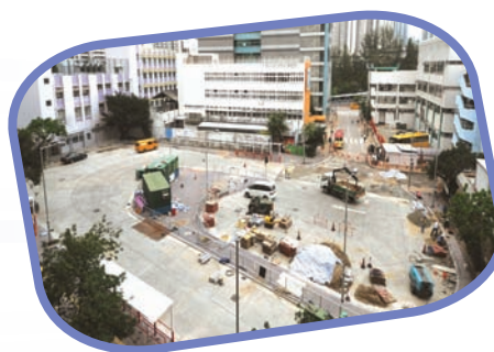
The Fuk Tong Road Bus Terminus under construction.

In implementing this project, the URA has continued its ongoing programme of consultation of all stakeholders including relevant Government departments, the Kwun Tong District Council, residents, the Kwun Tong District Advisory Committee, hawkers, transport operators, professional bodies and local concern groups.