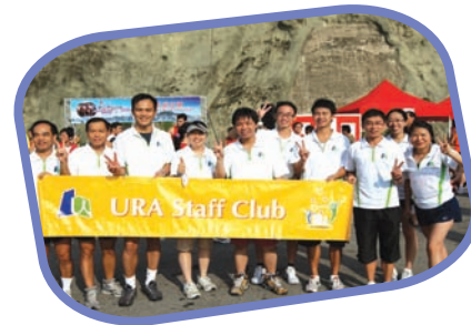
URA staff participate in a distance run competition organised by the Staff Club.

Although the organisation grew rapidly in the year and it was difficult for some staff to adapt and settle in their early days with the organisation, staff turnover has been stable. The overall staff turnover rate slightly dropped from 13.7 percent in 2007/08 to 13.5 percent in 2008/09. Over the same period, the turnover rate for senior staff also dropped from 14.3 percent in 2007/08 to 10.7 percent in 2008/09 which reflected, to a certain extent, the positive effect of the enhancements made during the year to the URA's internal communication and staff induction and engagement activities.