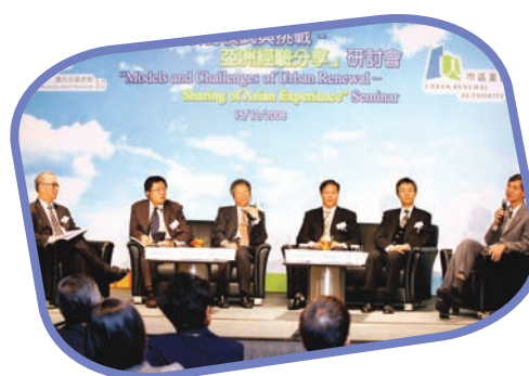
Overseas and local experts participate in the "Models and Challenges of Urban Renewal : Sharing of Asian Experience" Seminar.

In 2008/09, URA's public hotline service, neighbourhood centres and Kwun Tong Resource Centre handled some 14,400 enquiries and requests for assistance as well as 16 complaints. We fully met our performance pledge to provide same-day replies for 95 percent of all enquiries, replies within five days for 90 percent of all requests, and replies within 14 days for 90 percent of all complaints. The one-stop hotline service between the URA, HKHS and BD also provided an effective means of handling public enquiries and requests for building rehabilitation and maintenance assistance as well as OBB, a specific joint action launched by the Government, URA and HKHS to both improve building safety and create more job opportunities in view of the difficult economic situation.