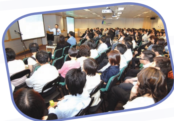
Communication session for all staff and senior management.

In addition, staff members from different levels were invited to meet with senior management in a series of structured internal communication sessions. Special gatherings were held for new hires to help them to settle in to their new jobs in URA. Views and comments gathered on such occasions and actions taken were communicated to all staff for sharing.