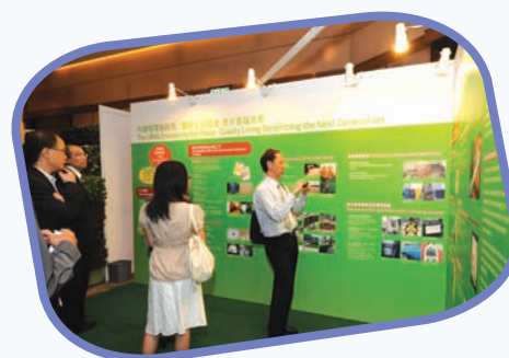
URA's exhibition booth in the seminar showing its environmentally sustainable policy.

As part of this policy, URA organized a seminar under the theme "Green Homes: Building an Environmentally Sustainable Future for Hong Kong" in May 2009 to increase public awareness of the importance of protecting the environment and encourage the community to adopt more environmentally-friendly property planning and development practices. This well received seminar was opened by the Secretary for Development and our Chairman. During the seminar, expert overseas speakers from the United Kingdom, United States of America, France and Hong Kong shared their experiences and insights with over 350 delegates and exhibitors drawn from a broad cross-section of Hong Kong's community. The Secretary for the Environment delivered a keynote speech at the luncheon meeting which followed.