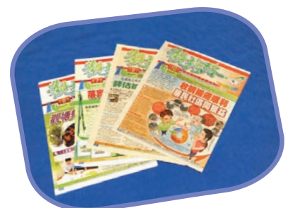
The Kwun Tong Bulletin provides updated information on the project.