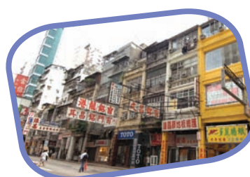
A cluster of 10 shophouses of outstanding heritage value will be preserved and revitalised in Shanghai Street / Argyle Street.