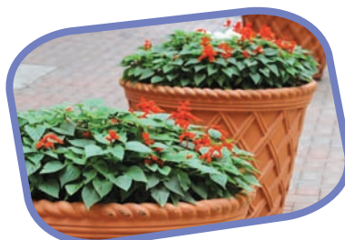
Greening facilities provided in Queen Street, Sheung Wan.