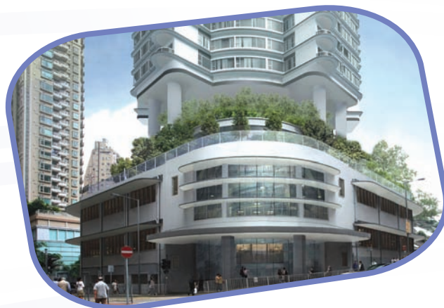
The core elements preservation approach of the Wan Chai Market building.