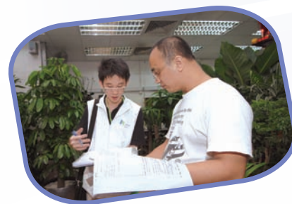
URA staff conducts an occupancy survey upon the commencement of the Prince Edward Road West/ Yuen Ngai Street project.