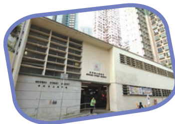
(from top) Three tenement buildings at 10-12 Wing Lee Street will be preserved. New medium rise cascaded buildings along Shing Wong Street are proposed in order to maintain the visual and physical integrity of the street. The Bridges Street Market will be preserved.