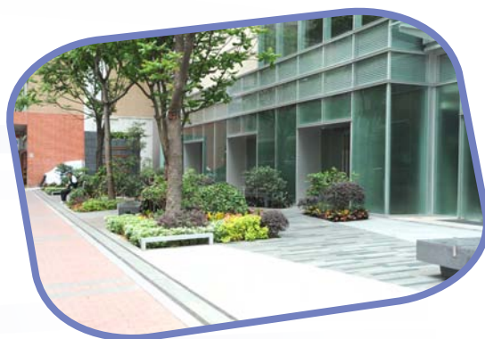
Landscaped area at Po On Road/Shun Ning Road project (Beacon Lodge).

Meanwhile, in Sheung Wan which is home to several URA projects, improvement works at Tung Street were substantially completed in late 2008 to link the earlier revitalisation of Sheung Wan Fong to the recently enhanced Hollywood Road. The URA, at the behest of the Central and Western District Council, has undertaken a feasibility study on revitalising the Pak Tsz Lane area which comprises an existing RCP, and an underutilized 'landlocked' local open space. The said area is part of the Dr Sun Yat Sen Historical Trail and is close to three other locations that have historical significance in the revolutionary history of modern China, as well as being in close proximity to the conservation and revitalisation elements within the adjacent Peel Street/Graham