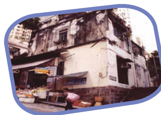
Design concept of the preserved elements in the Yu Lok Lane project.