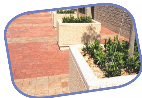
New paving and street greening in Cherry Street, Tai Kok Tsui.