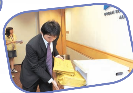
Property developer submits tender for the joint development of the project.