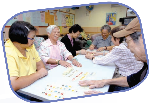
Senior citizens enjoy the facilities provided by the St. Matthew's Neighbourhood Elderly Centre in the Queen Street project (Queen's Terrace).