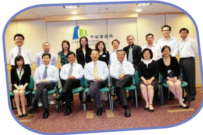
Members of the URA Staff Club for 2008/09 and the senior management.

As a caring employer and in view of the financial turmoil and the workload faced by staff members in a growing organisation with a significant proportion of its staff members being new comers, URA organised regular updates and information sharing sessions on various topics, including work / life balance and stress management, to help staff to maintain their physical and mental wellness and cope with the challenges and stresses of work.