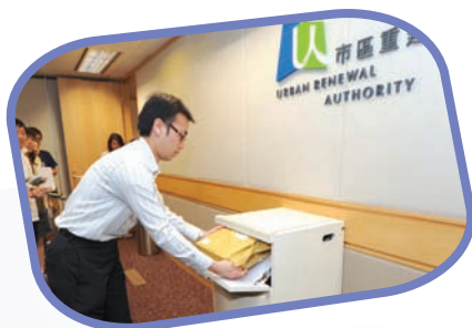
Estate developer submits tender for the joint development of the Lee Tung Street/McGregor Street project.

Of the 10 projects commenced by and inherited from the LDC, six have been completed with all flats sold, three have obtained their certificates of compliance with flat sales and commercial leasing now under way, while one is under construction. The final project comprises three sites, with construction on two of these sites having been completed and most flats sold and most commercial spaces leased out and construction on the third site now under way. These 10 inherited projects have helped almost 14,000 people to improve their living conditions, as well as producing over 6,000 new homes plus various GIC and commercial facilities and public open space.