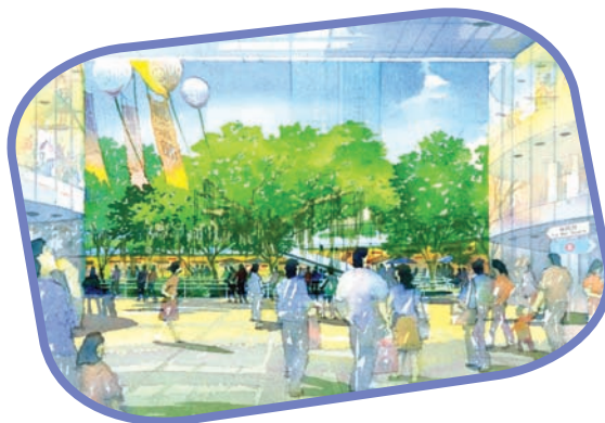
Kwun Tong Town Centre project incorporates an “urban window” design.

URA is developing this project according to five guiding principles –