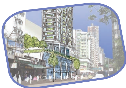
Artist's impression of Shun Ning Road project.

In June 2009, URA commenced this modest sized project of around 827m 2 , which is located at Shun Ning Road in Sham Shui Po. It comprises five buildings, which were built in 1954 or 55, are of five storeys in height and contain about 180 households. These buildings are in generally dilapidated condition with various unauthorized structures. URA plans to redevelop this site for residential use with modest commercial provision in line with its Residential (Class A) zoning. This is the 13th redevelopment project implemented by the URA to help improve people's living conditions and the environment of Sham Shui Po. Of these 13 projects, five are being implemented in collaboration with HKHS. In addition to these redevelopment projects, URA has carried out an extensive programme of building rehabilitation work in this district over the past five years benefiting some 42 buildings comprising over 1,900 flats. The public objection period for this project under Section 24(1) of the URAO will expire on 26 August 2009.