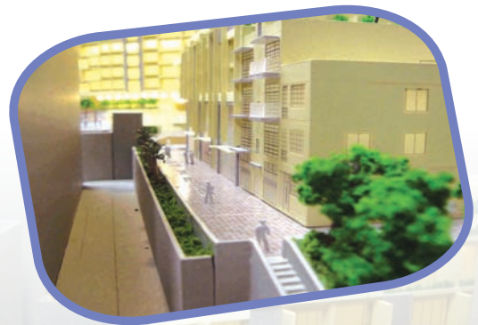
The design concept of the project maintains the visual and physical integrity of the streets.

Subsequently, in April 2009, an alternative MLP was submitted to the TPB by four owners of property within Site C of the project and a rezoning application covering Site C was submitted under Section 12A of the TPO. In late July 2009, the TPB considered the rezoning application submitted by the four owners at Site C and decided to defer the consideration of URA's MLP until a decision on the rezoning application has been made.