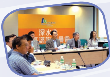
Meeting of the Sham Shui Po District Advisory Committee.

The URA is fully aware of the importance and benefits of effective community relations and reaches out to the communities in the URA's action areas as an integral part of our people-oriented community engagement strategy. Intensive efforts continued to be made throughout the year to engage all relevant stakeholders with a view to ensuring that the sentiments and concerns of stakeholders in individual projects are taken into consideration during the planning and acquisition stages of such projects. The URA reaches out to all residents groups, concern groups, local consultative bodies, educational institutions, professional bodies, politicians, and the mass media to cultivate and foster better mutual understanding with all stakeholders, to address their legitimate concerns as far as practicable and to enlist both local and general public support.