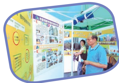
Participants at the URA booth during the Building Safety Carnival jointly organised by the URA, the Buildings Department and Hong Kong Housing Society.

More fresh looking buildings with thematic colour designs are appearing in our Action Areas as a result of our rehabilitation work. In 2008/09, in addition to the technical advice offered to owners' corporations, we provided design services to some 50 buildings in prominent locations in Sheung Wan, Tai Kok Tsui, Hung Hom, Tsuen Wan and elsewhere in order to bring out the unique characters of individual buildings upon completion of their respective rehabilitation works. Similar services were extended to cover three clusters of buildings in various localities such as Tai Kok Tsui Road in Tai Kok Tsui, Tai Ho Road in Tsuen Wan and Queen's Road East in Wan Chai, in order to uplift the appearances of entire neighbourhoods by use of coordinated colour designs for their external appearances.