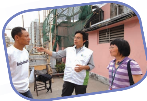
URA offers technical advice to owners.

by government departments and public bodies e.g. Buildings Department (BD) and HKHS. We publicized the benefits of building rehabilitation and common issues related to it through seminars, rehabilitation bulletin and media interviews.