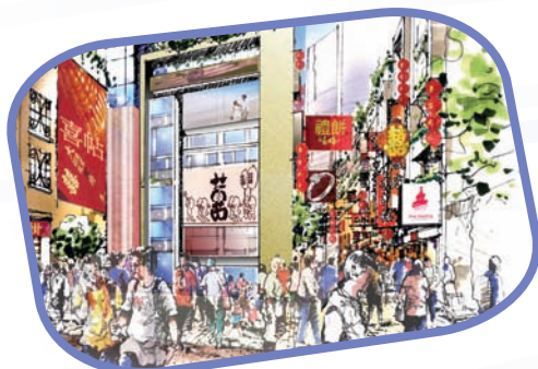
Wedding City theme for the Lee Tung Street project.