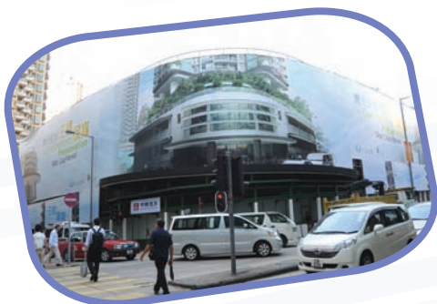
Special hoarding design for the Tai Yuen Street/Wan Chai Road project site.

Demolition of the non-core elements commenced in November 2008. Prior to and during the process of their demolition, URA took careful photographic, film and cartographic records, for future reference, of the non-core elements of the structure. The Supplementary Agreement for the Core Preservation Scheme was executed between URA and its joint venture development partner on 31 December 2008. General Building Plans for the Core Preservation Scheme were approved in March 2009. Foundation work will begin in the second half of 2009, following completion of demolition of the non-core elements.