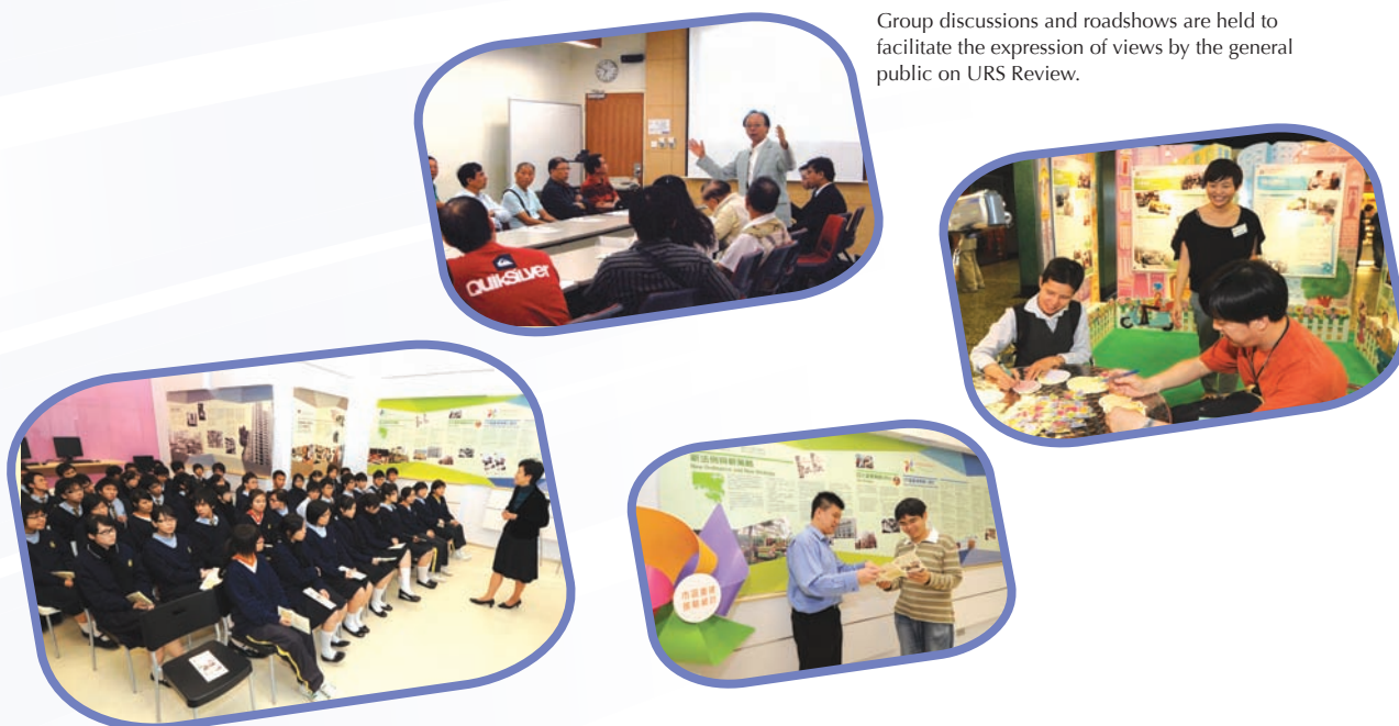
Public engagement activities organised in the Idea Shop.