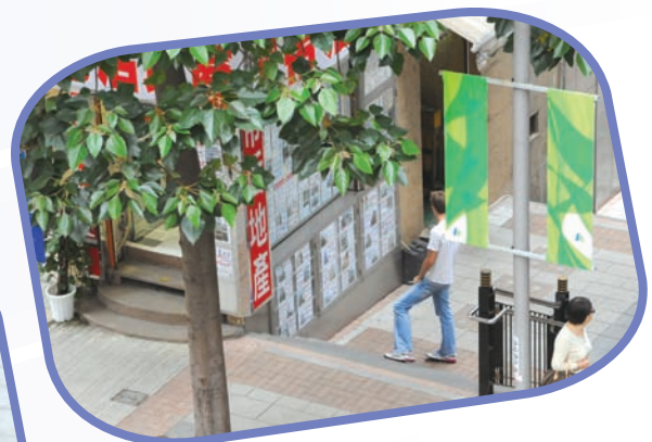
New Street furniture in Tung Street, Sheung Wan.