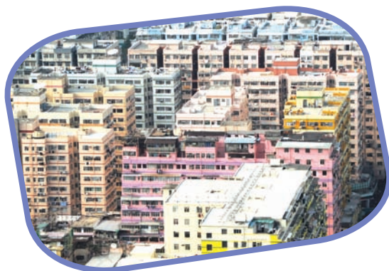
Fresh looking buildings with thematic colour designs are appearing in Tsuen Wan and Tai Kok Tsui as a result of URA's rehabilitation work.