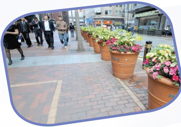
New paving and street planting in Morrison Street, Sheung Wan.

Street and Staunton Street/Wing Lee Street projects described previously. This project was one of the 10 community revitalisation/ improvement projects which the URA announced, in November 2008, that we would commence in 2009/10 with the aim of helping to create job opportunities and boost local economic activities. Specifically, the URA aims to improve pedestrian accessibility to the Pak Tsz Lane area from the surrounding streets, especially from Gage Street and Hollywood Road; take the opportunity to highlight the historical importance of the area in Hong Kong/Chinese history; supplement and connect the various area-based revitalisation and preservation initiatives being pursued by the URA in our Peel Street/Graham Street, Staunton Street/Wing Lee Street and Yu Lok Lane projects; and expand and modernize the Gage Street Refuse Collection Point. All Government Departments have agreed in principle to these revitalisation proposals. URA is now consulting relevant Departments concerning the detailed design and technical assessments. The Central and Western District Council have expressed their support and urged URA to expedite implementation. The URA has also been invited to join the Central and Western District Council Harbourfront Working Group. URA is now undertaking a feasibility study on improvements to the Western Wholesale Market and the surrounding waterfront area, with a view to revitalising the underused market and the surrounding waterfront land.