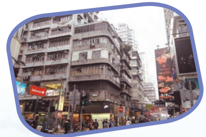
Existing view of the Sai Yee Street project. (top) The design concept of the Sports Retail City.

General acquisition offers were made to all affected domestic and non-domestic owners in March 2008 and acquisition has been progressing steadily since then.