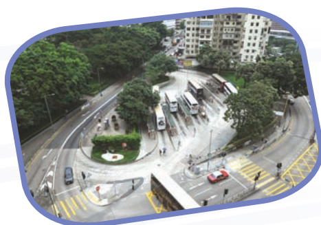
The Yuet Wah Street Bus Terminus.

Due to the huge size of the project, URA plans to divide the two sites into different areas and to redevelop these areas in phases. The first phase, comprising the Yuet Wah Street Site, which entails relocation and redevelopment of the Yuet Wah Street Bus Terminus in the summer of 2009, is at an advanced stage of implementation planning. Expressions of interest in redeveloping it were invited from potential joint-venture partners in July 2009, with a view to inviting tender bids in the following month for award in October 2009.