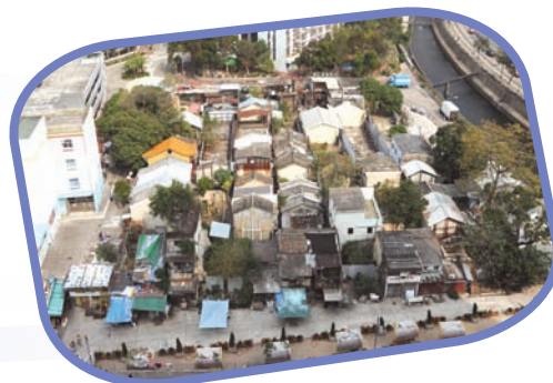
The Tin Hau temple, the village gatehouse, stone tablet and a number of authentic village houses will be preserved within a themed conservation park in the Nga Tsin Wai Village project.