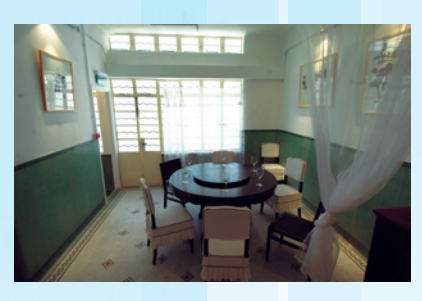
The shophouse at No.18 Ship Street has been restored and turned into a Chinese restaurant.