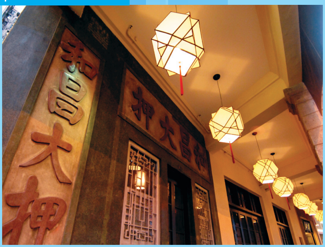
A row of four Cantonese verandah shophouses including the Wo Cheong Pawn Shop has been revitalised for adap