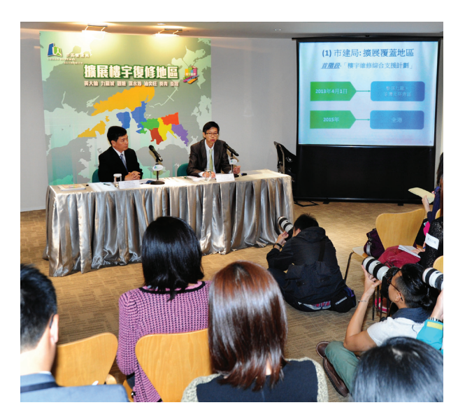
Press conference on the new arrangements of URA's building rehabilitation service areas.

units) have been rehabilitated under the MIS and 230 buildings (19,160 units) under the LS. Currently, there are a total of 187 IBMAS cases in progress, including 97 CAS and 6 CAL cases. The financial assistance, technical advice and coordination services provided by the URA to Owner's Corporations are welcomed judging by the enthusiastic response.