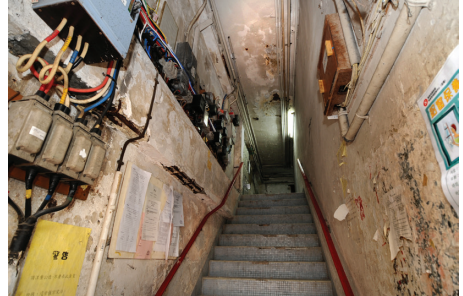
Mee Wah Building in Tsuen Wan before and after rehabilitation.