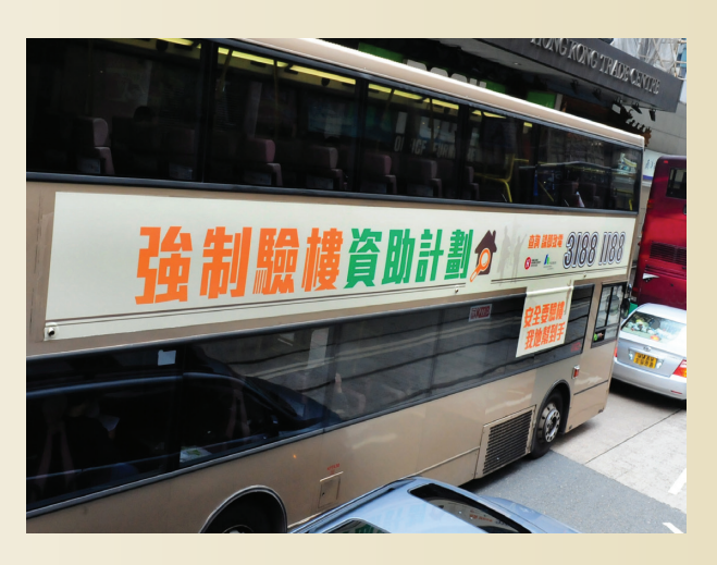
Advertisement on bus to promote the Mandatory Building Inspection Subsidy Scheme.

with URA providing a one-stop continual building care service.