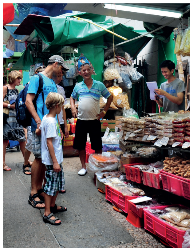
Existing view of the century-old wet market.

Preparations are progressing to commence the Site B foundation works. Sites A and C were reverted to the Government in March 2014 and preparations for the Land Grants for these sites are in hand.