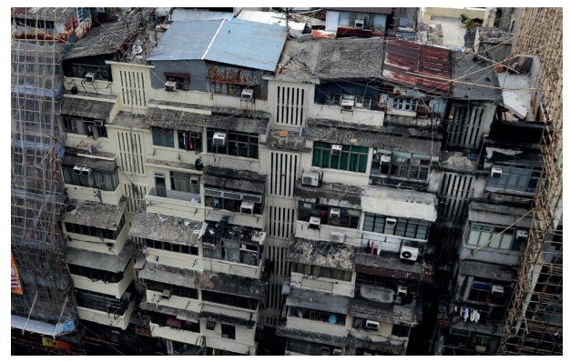
Existing view of the project.

This project covers a site area of 1,900 square metres and comprises eight pairs of six-storey buildings built in 1955 and 1956. There are 217 households living in the site. The project is relatively large and can produce around 232 flats and 2,474 square metres of commercial floorspace.