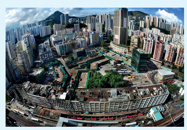
Clearance of Development Areas 2, 3 and 4 of the Kwun Tong Town Centre project is completed.

This complex project is being implemented in three phases, with the site divided into five Development Areas. Clearance of Development Areas 2, 3 and 4 was completed in December 2013. The URA has invited property developers to tender for the development of Development Areas 2 and 3. Meanwhile the occupation permit for Development Area 1 was issued in June 2014 and flat sales are underway. The phased development approach will enable the early reprovision of the existing Kwun Tong Jockey Club Health Centre to Development Area 1, and the Methadone Clinic to the Hoi Yuen Road