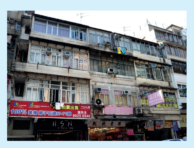
The facilitation project at Lion Rock Road in Kowloon City is successfully sold out through public auction.

Under its 'facilitator' role, the URA has so far provided services to four facilitation projects during 2013/14. On 7 November 2013, the joint sale for public auction of a facilitation project of around 328 square metres at 67-71 Lion Rock Road in Kowloon City was successfully completed with 100% owners' participation. This marked a major milestone for the Facilitating Services Scheme.