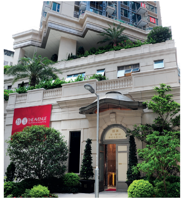
The Lee Tung Street/McGregor Street project, URA's first project to adopt environmental provisions in a comprehensive way.

This is also the first URA project that comes with a formalised comprehensive environmentally friendly policy. It has been planned to significantly reduce carbon emissions from the project.