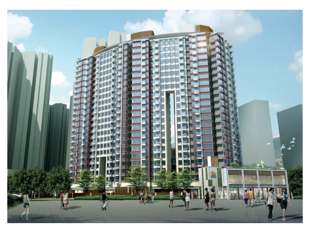
Artist impression of the Kai Tak Flat-for-Flat development.