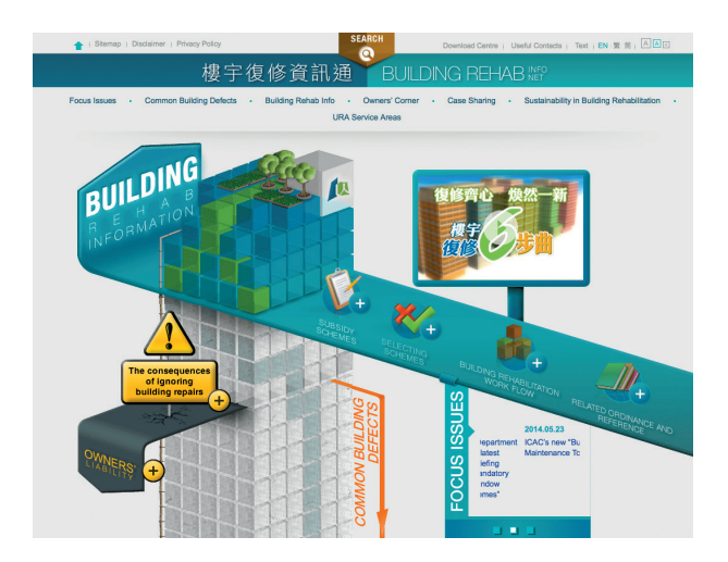
The "Building Rehab Info Net" provides property owners with comprehensive information related to building maintenance and repairs.

promotion of rehabilitation was in full swing across all platforms including day-to-day assistance provided to eligible owners, the URA's NGO partners, and the holding of regular seminars and briefings.