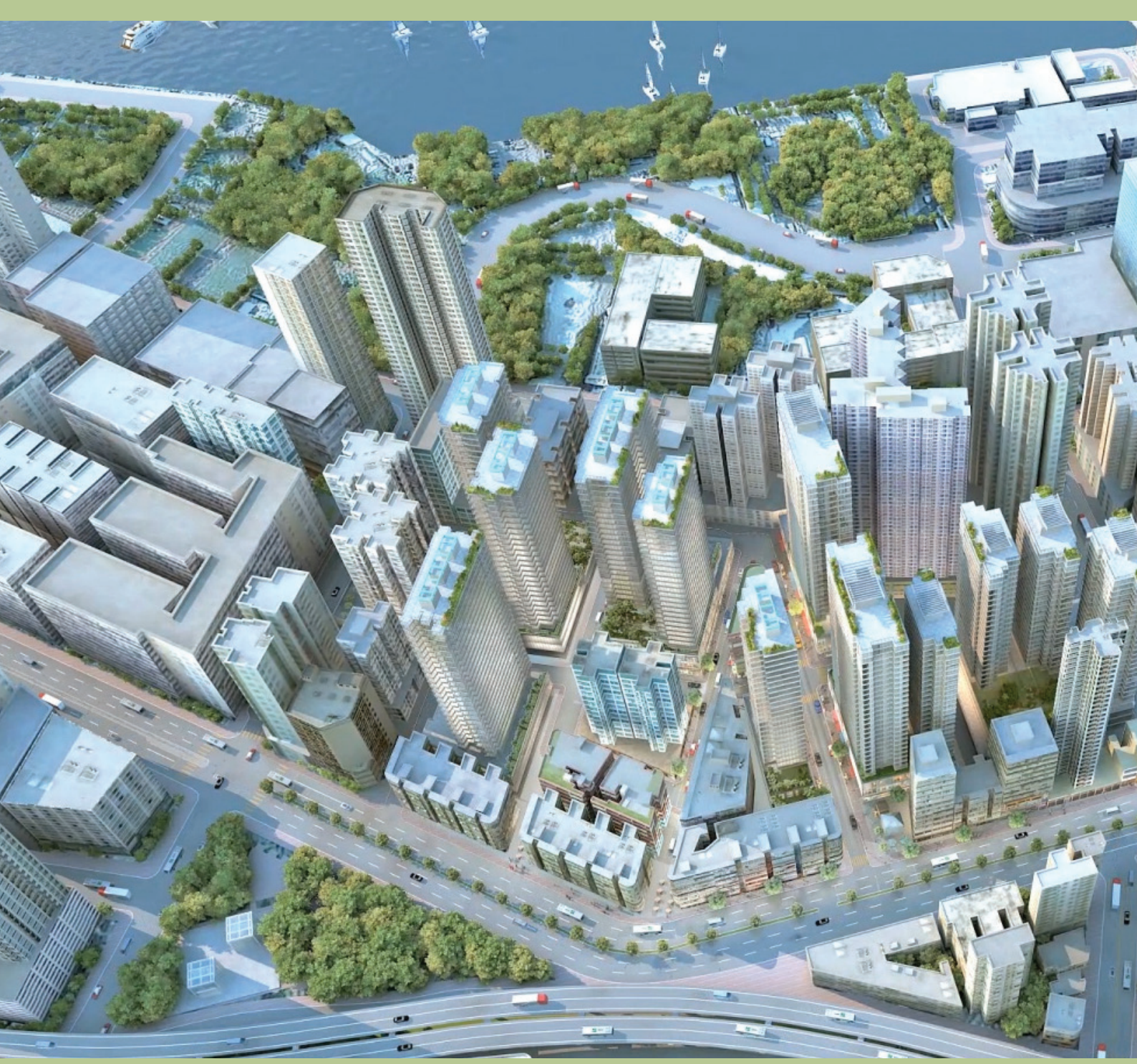
\blacksquare Artist impression of the District-based approach.