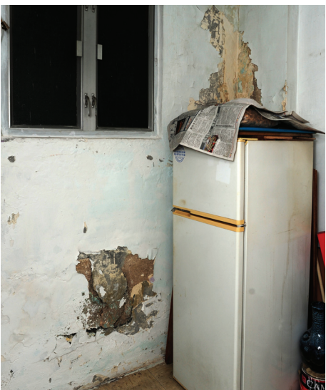
Poor building condition at the project site.

In view of this, the URA advanced the application for the fifth round of Demandled Scheme projects in February 2016 and extended the application period to three months. Altogether 19 applications were received by the deadline in May 2016. Applications will go through the stringent screening and scoring process.