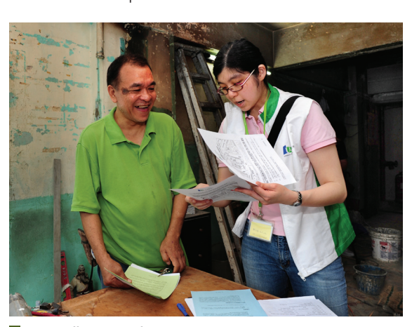
URA staff conducts freezing survey at the Ash Street Demand-led redevelopment project.

The fourth round of application was launched in July 2015. Of the 77 applications received in the fourth round, most were applications from the applicant-owner of one single flat only which failed to meet any of the application requirements. In fact, only one application was able to meet all application requirements. However, after a stringent screening and scoring process conducted by the URA, this application was considered unsuitable for implementation