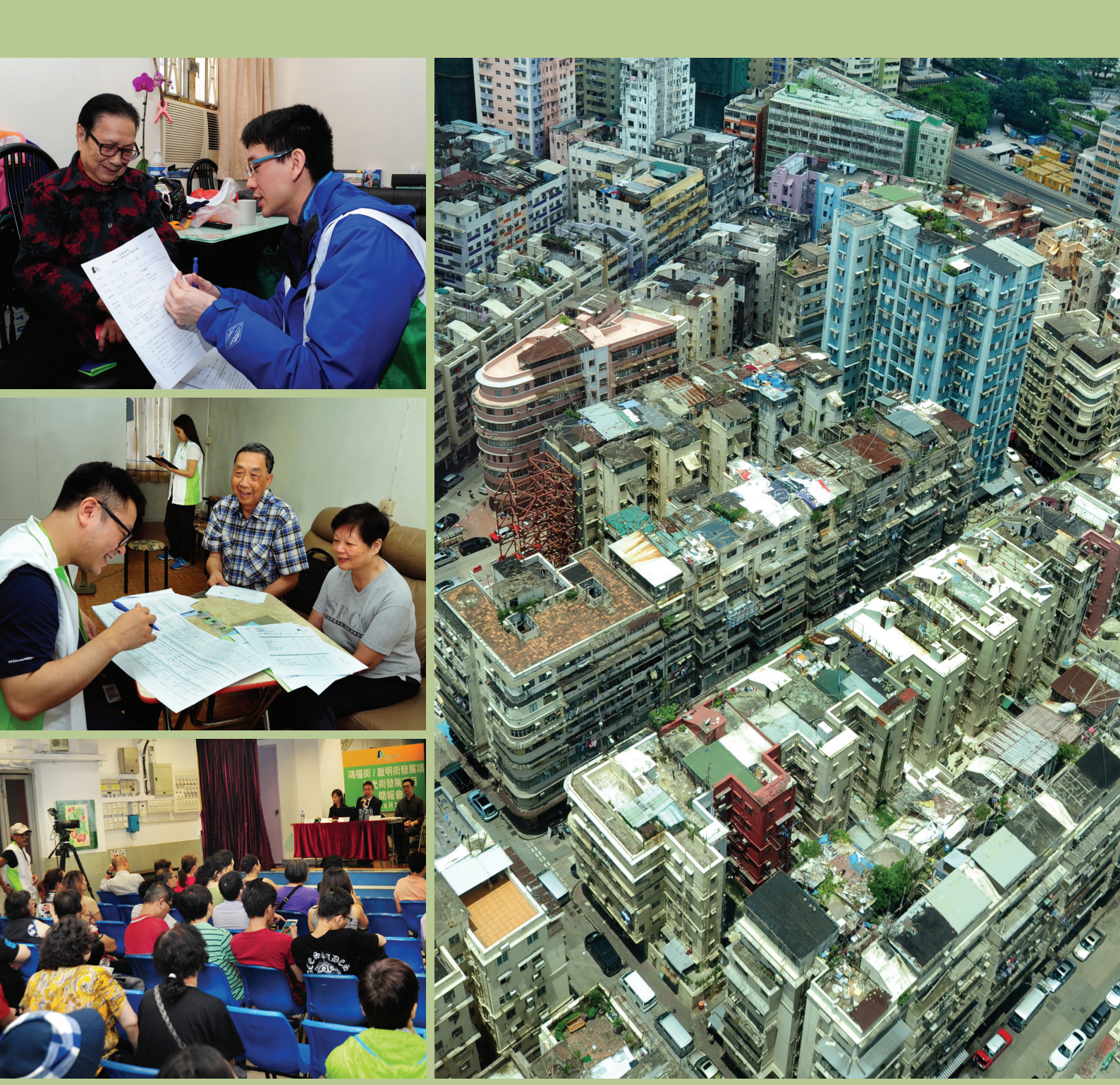
\blacksquare \ \, \text{Commencement of three redevelopment projects in To Kwa Wan and the existing view of the projects}.