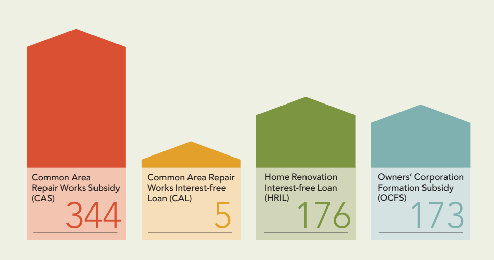
A total of 698 applications under IBMAS within URA's scheme areas are received in 2015/16 financial year.

MANDATORY BUILDING INSPECTION SUBSIDY SCHEME