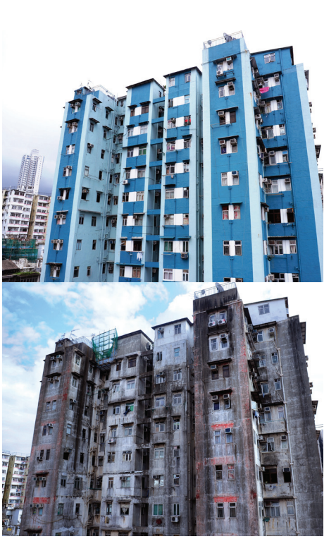
Over 1,300 buildings within URA's service areas are benefited under OBB.

The URA has given full support to the Government's Operation Building Bright (OBB) programme since it began in 2009. At the end of 2015/16, 1,340 buildings comprising around 55,100 units out of the 1,420 target buildings within the URA's RSAs had either been rehabilitated or had rehabilitation works substantially completed. these 1,340 buildings, 83 buildings (around 6,600 units) had either been rehabilitated or had rehabilitation works substantially completed within the financial year of 2015/16. OBB has raised owners' awareness of the need for rehabilitation as well as created employment opportunities, which was one of the original objectives of the scheme. Through conscientious efforts and collaboration with the Independent Commission Against