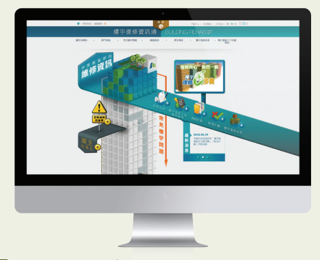
Building Rehab Info Net provides one-stop comprehensive information on building rehabilitation.

The "Building Rehab Info Net" - www. buildingrehab.org.hk website was launched in January 2014 to serve as a onestop e-platform for building owners as well as building professionals and contractors to access comprehensive building rehabilitation-related information. Since its launch, the website has recorded over 56,000 visits up to the end of March 2016. The Phase 3 enhancement of the Building Rehab Info Net was launched on 2 July 2015.