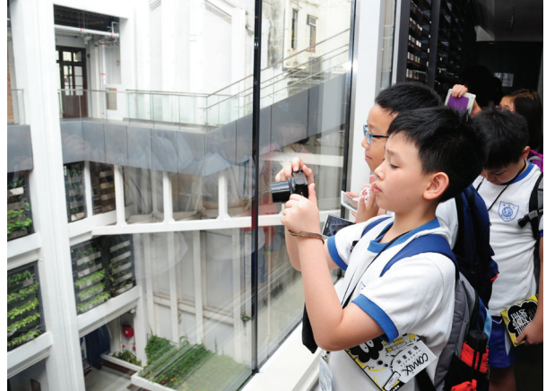
■ Entering its third year, "Comix Home Base" has become a popular attraction in the community.