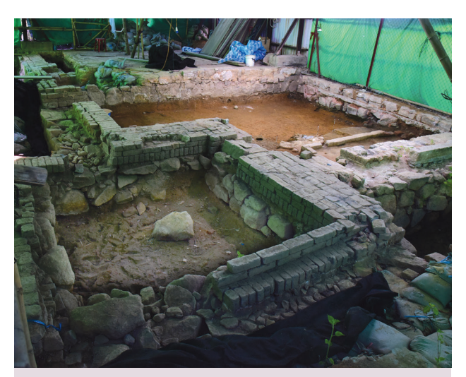
於衙前圍村西南角發現的圍斗及圍牆遺跡整觀。 Overall view of watchtower and village wall remains at the southwest corner of the Nga Tsin Wai village.

市建局於六月七日公布衙前圍村項目的考古影響評估的初步結果及現階段和下一步的工作:包括根據獨立考古專家的建議,擴大考古及發掘範圍,讓考古專家就項目的發現及整體文物的價值,進行全面評估。目前,考古評估工作仍在進行中,現階段市建局並未就保育方案有任何定案,亦不會在保育方案完成及得到政府部門同意之前,展開任何發展。