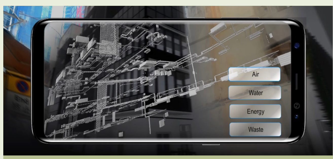
透過加入智慧元素,住客可從手機及平板電腦獲得樓字管理的資料。 Residents can obtain building data through mobile devices with the introduction of smart elements.

創新科技,為樓宇的狀況作更準確的「斷症」, 甚至在其仍未出現「病徵」前,鼓勵進行預防性 保養,以保持樓宇良好狀態,減慢老化的速度。 在進行樓宇維修工程過程中,現時一般做法,是 由工程顧問安排測量人員以傳統目測方法為樓宇 進行初步勘察,並為樓宇進行測量和繪製圖則工 作,以進行工程數量及成本估算。由於工程顧問 和其他有意入標的工程承建商,在實地測量時容 易出現不一致的工程估算,從而產生不一樣的投 標價格,業主們難以作出判斷,影響業主間達成 共識。