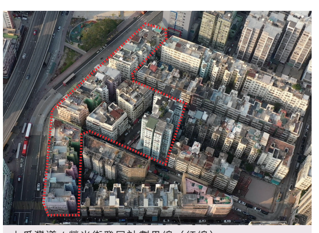
土瓜灣道 / 榮光街發展計劃界線(紅線) The boundary (red line) of To Kwa Wan Road / Wing Kwong Street Development Scheme

The Urban Renewal Authority (URA) commences the statutory planning procedures of the To Kwa Wan Road / Wing Kwong Street Development Scheme (KC-016). The project is implemented under the district-based urban renewal approach adopted since 2016, aiming to enhance accessibility and connectivity of the district and the seven other commenced projects in the neighbourhood through restructuring and replanning the land uses, as well as the pedestrian and road networks. It will also create a more liveable community through enhanced urban design and the provision of more community facilities. The redevelopment will provide space for improved walkability by building a footbridge across To Kwa Wan Road connecting To Kwa Wan Station of the MTR's Tuen Ma Line to the project site. The project also covers the entire Yuk Shing Street, and part of Hung Fook Street and Kai Ming Street. The URA will restructure the site layout to provide more space for the use of pedestrians and community activities, thus creating a communal hub for leisure use and injecting vibrancy to the community, making the area more liveable and sustainable.